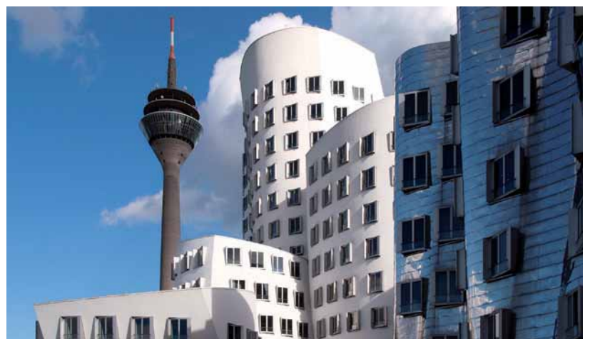
Potential operation site: Frank O. Gehry apartment complex in Düsseldorf.