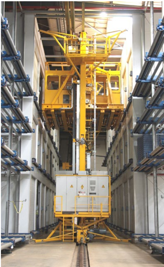
Automated ULD Cargo and Pallet Storage System including Cold storage (+ 1° C) Express Cargo Sorting Facility